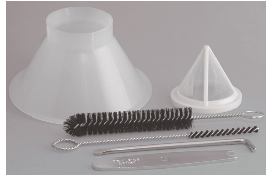
Kit contents are spray gun c/w selected air cap and tip set up, gravity cup, pouring funnel, spanner, torx key and cleaning brushes.