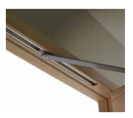
Track is discreetly concealed in the underside of the head frame.