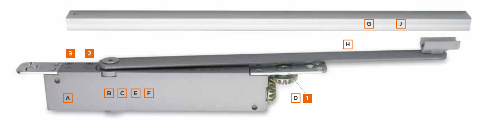
Adjustments: 1 - Closing power; 2 - Closing speed; 3 - Latch action; 4 - Backcheck

Providing exceptional ease of use by reducing the resistance encountered when opening the door, the Briton 2400 Series bridges the gap between the requirements for fire and smoke control and ease of operation required for accessibility.