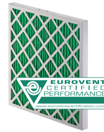
RedPleat ePM10 70%

RedPleat HT are designed for use in high temperature applications up to 260 °C.