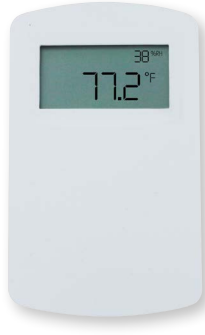
North American style